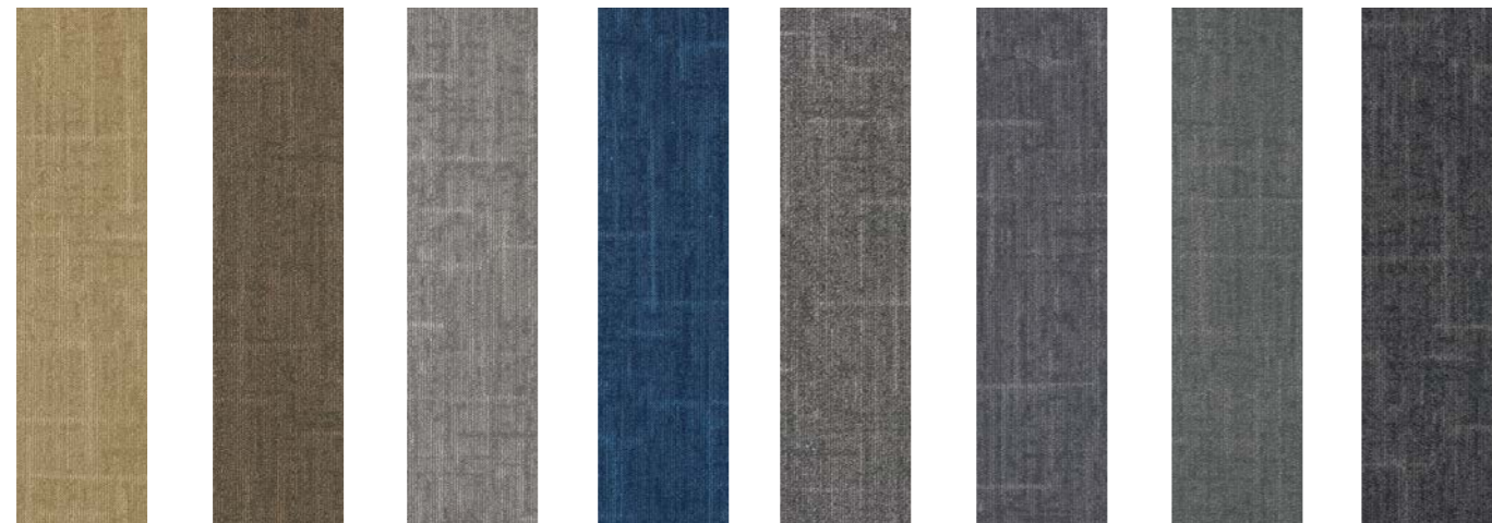
Noble-01 Noble-02 Noble-03 Noble-04 Noble-05 Noble-06 Noble-07 Noble-08